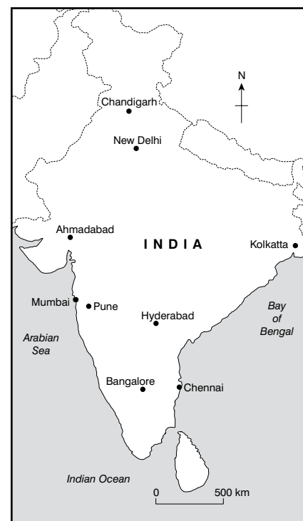
Figure 4: Major centres of India's offshore IT outsourcing industry

estimated at 6%. The service sector's contribution to India's GDP has increased from 15% in 1950 to over 50% (Figure 5).